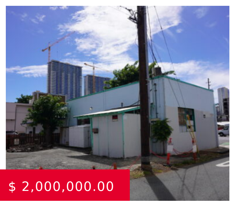
Excellent Owner-User or Redevelopment Opportunity in Central Honolulu

1246 South King Street, Honolulu, HI, USA