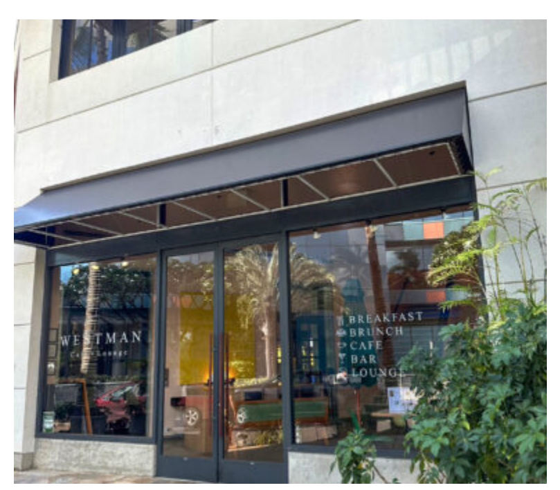
Restaurant Available For Lease Assignment in Waikiki