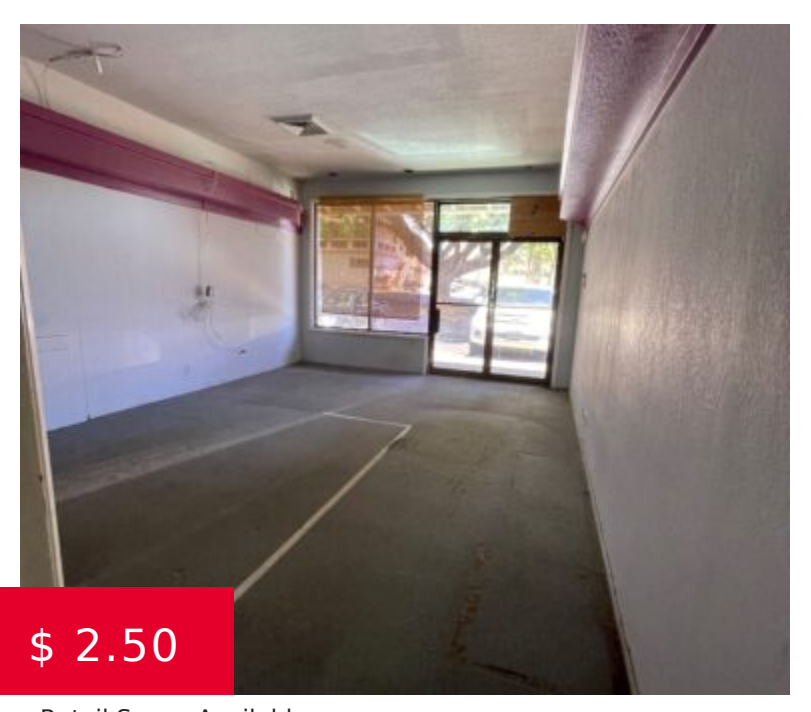
Retail Space Available