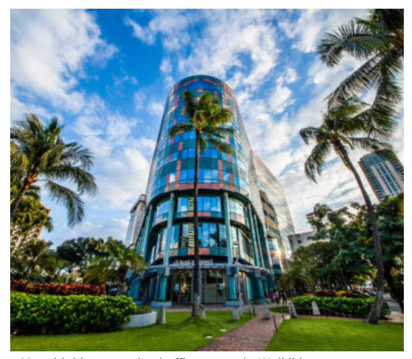
Most highly recognized office tower in Waikiki

2155 Kalakaua Ave, Honolulu, HI 96815, USA