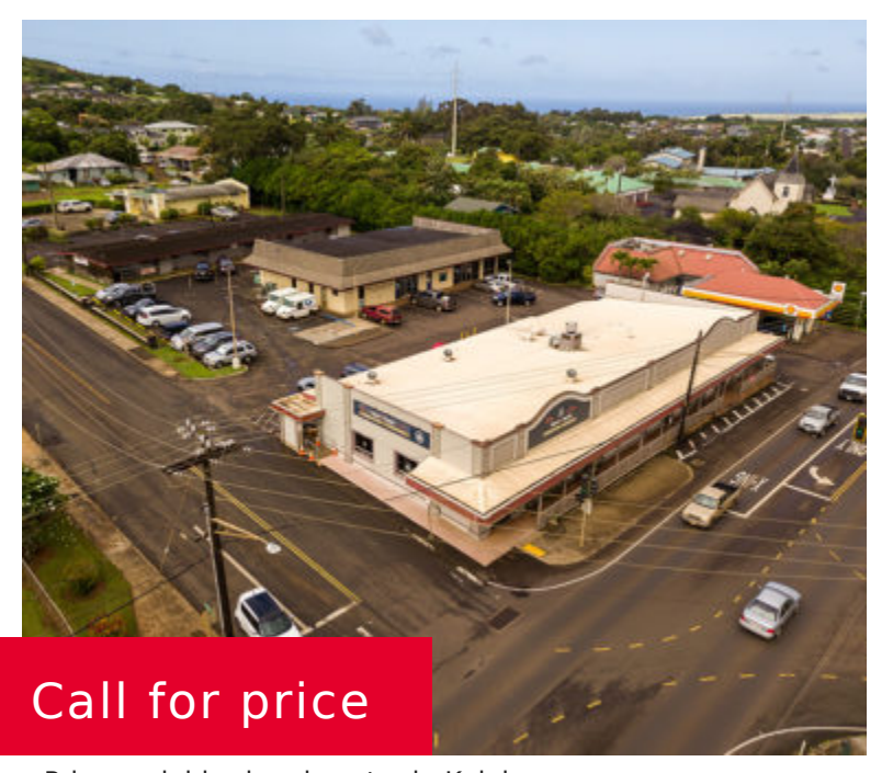
Prime neighborhood center in Kalaheo