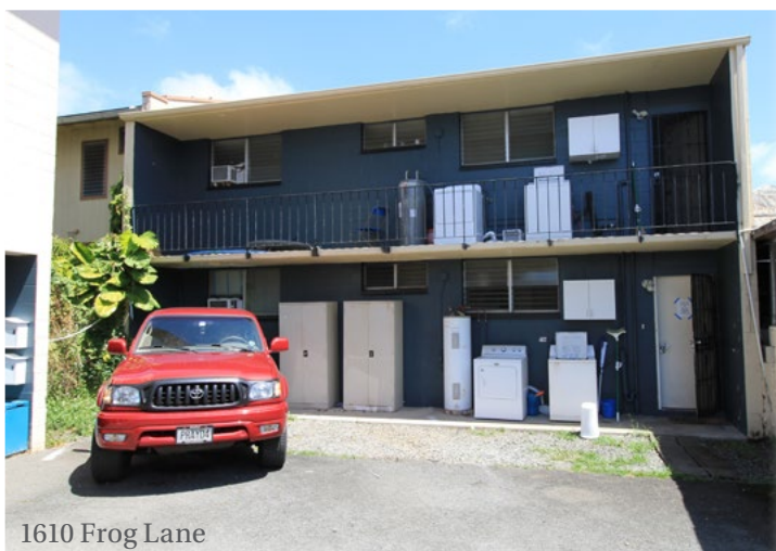
1610 Frog Lane