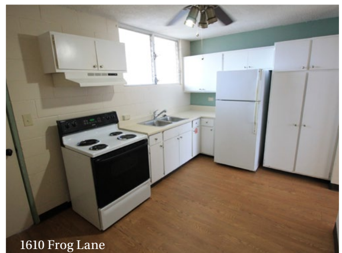
1610 Frog Lane