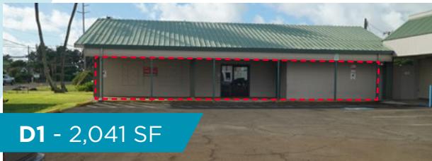
D1 - 2,041 SF