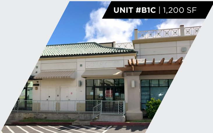
UNIT #B1C | 1,200 SF