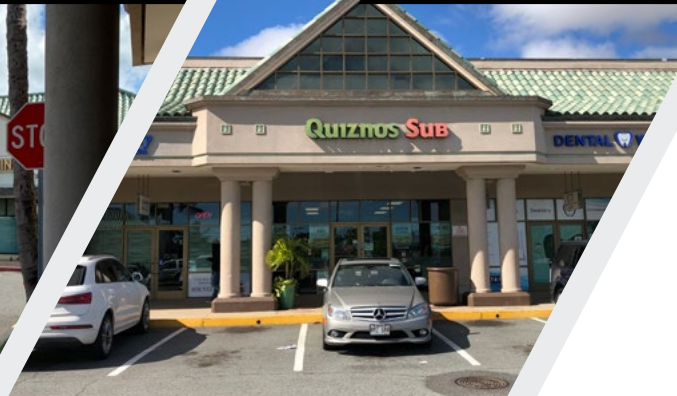
UNIT #22 | 1,000 SF