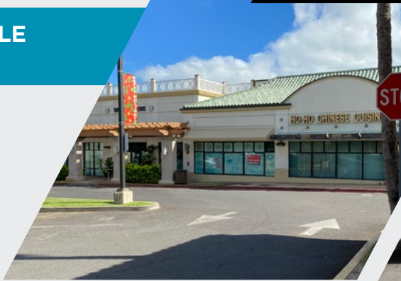
UNIT #A1 | 4,000 SF