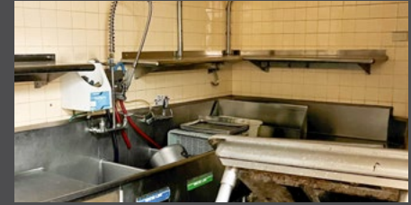
STAND ALONE BUILDING