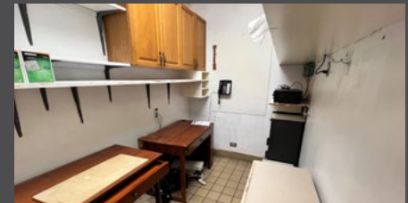
LONG-TERM GROUND LEASE AVAILABLE