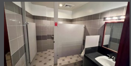
AMPLE PARKING AVAILABLE