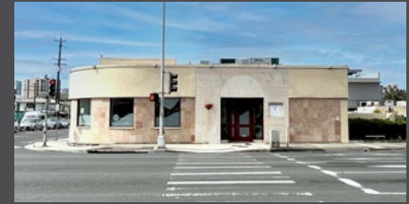
AMAZING KING AND MCCULLY LOCATION