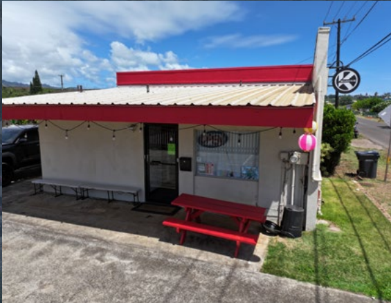
K SNACK SHACK Building Size 468 SF Website ksnackshack.com