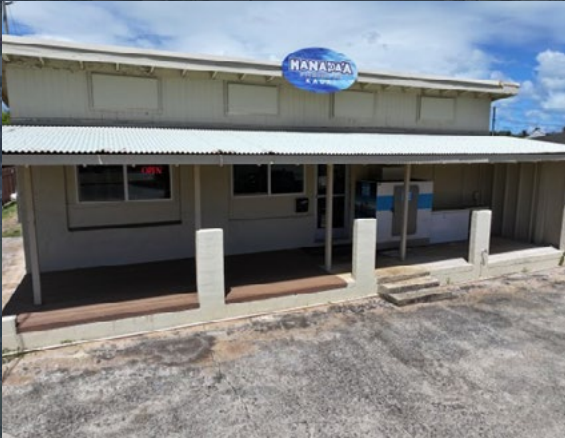
HANAPA'A FISHING CO. Building Size 998 SF Website hanapaa.com