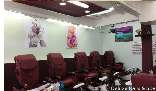
Deluxe Nails & Spa