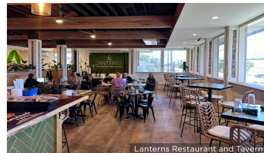
Lanterns Restaurant and Tavern