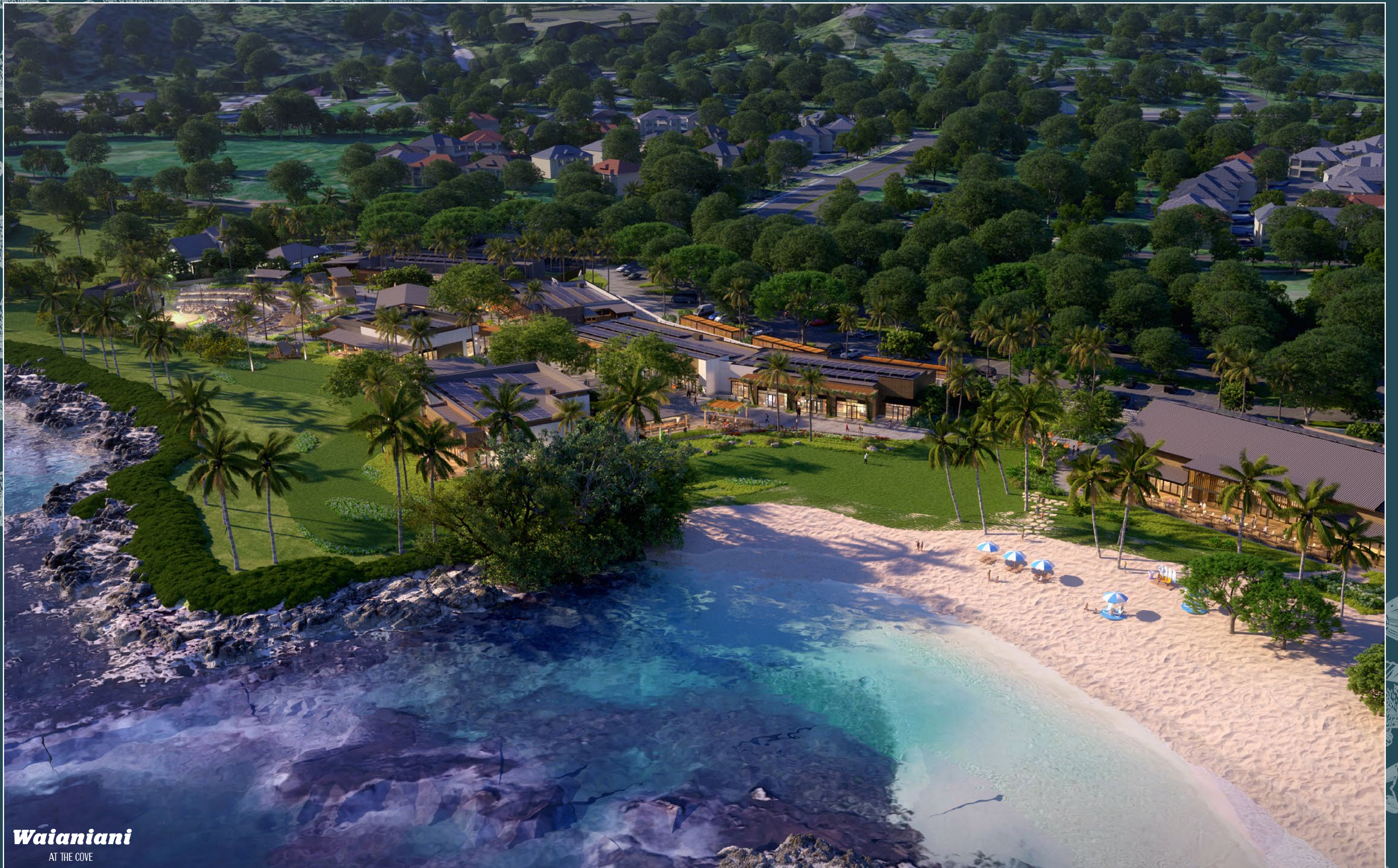
Waianiani AT THE COVE